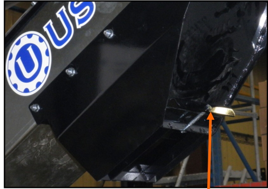
Sliding Clean Out Door

Remove shipping bolts after receiving conveyor