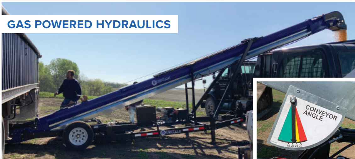
GAS POWERED HYDRAULICS