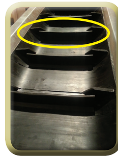
USC SEED SERIES Seed trays gently transport seed without pinching or damaging.